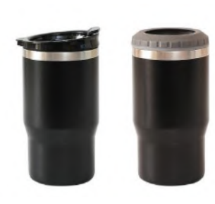
ATG-3118 Plastic spray