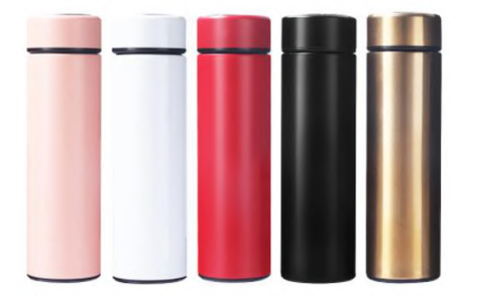
SMT-4314 SUS 304 Inner